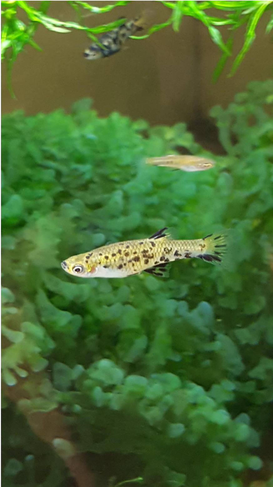
Phalloceros caudomaculatus [Female]