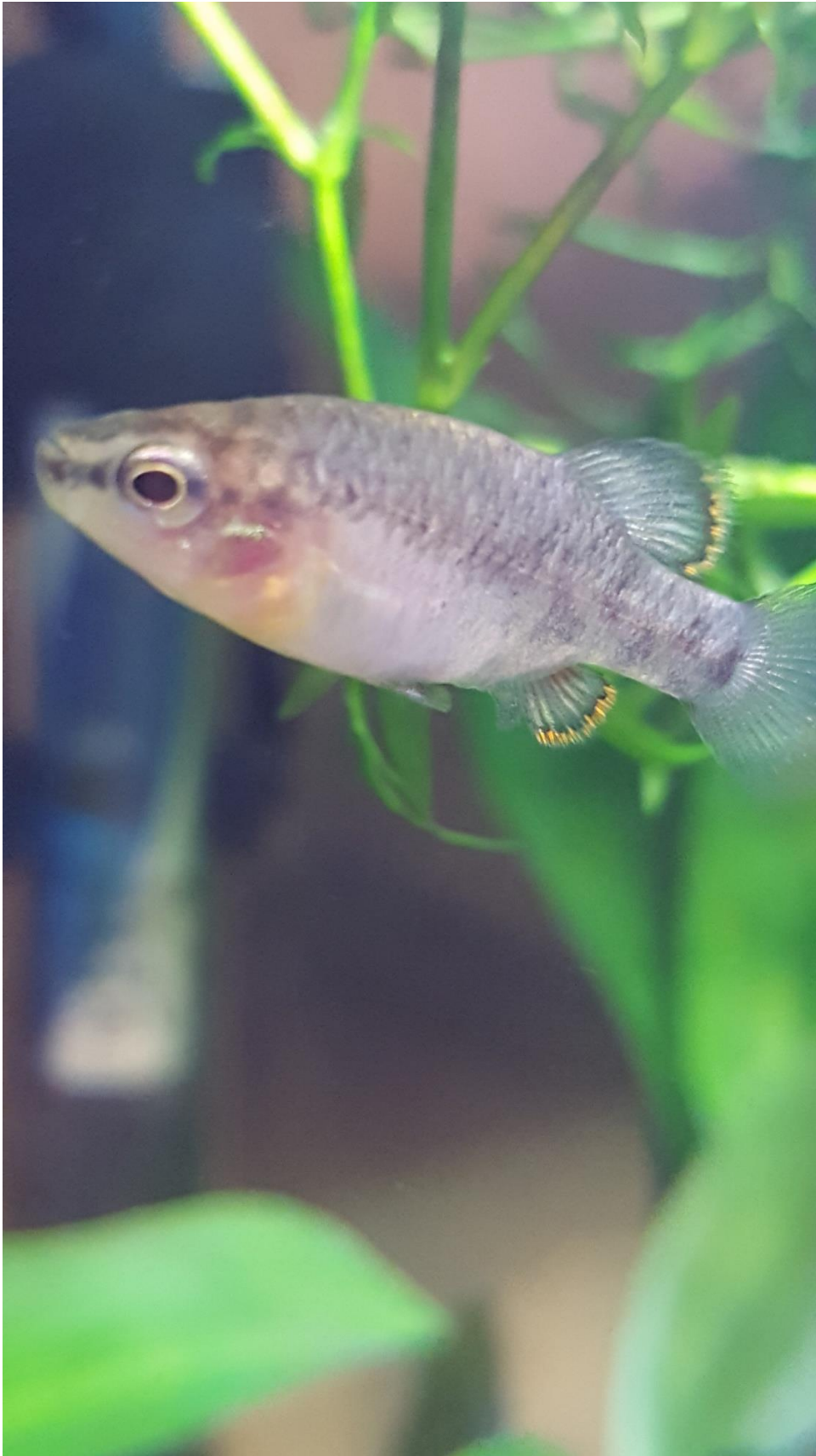
Zoogoneticus purhepachus , male