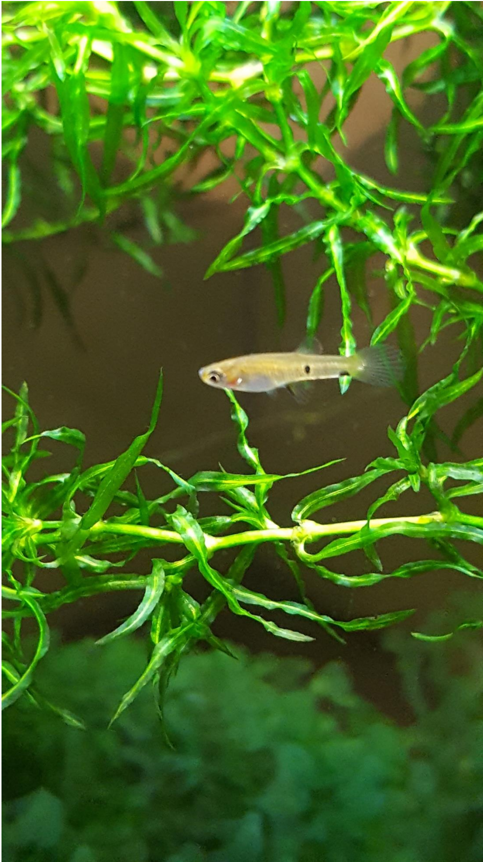
Phalloceros caudomaculatus [Juvenile] : Photo :- J. Sara Fulton