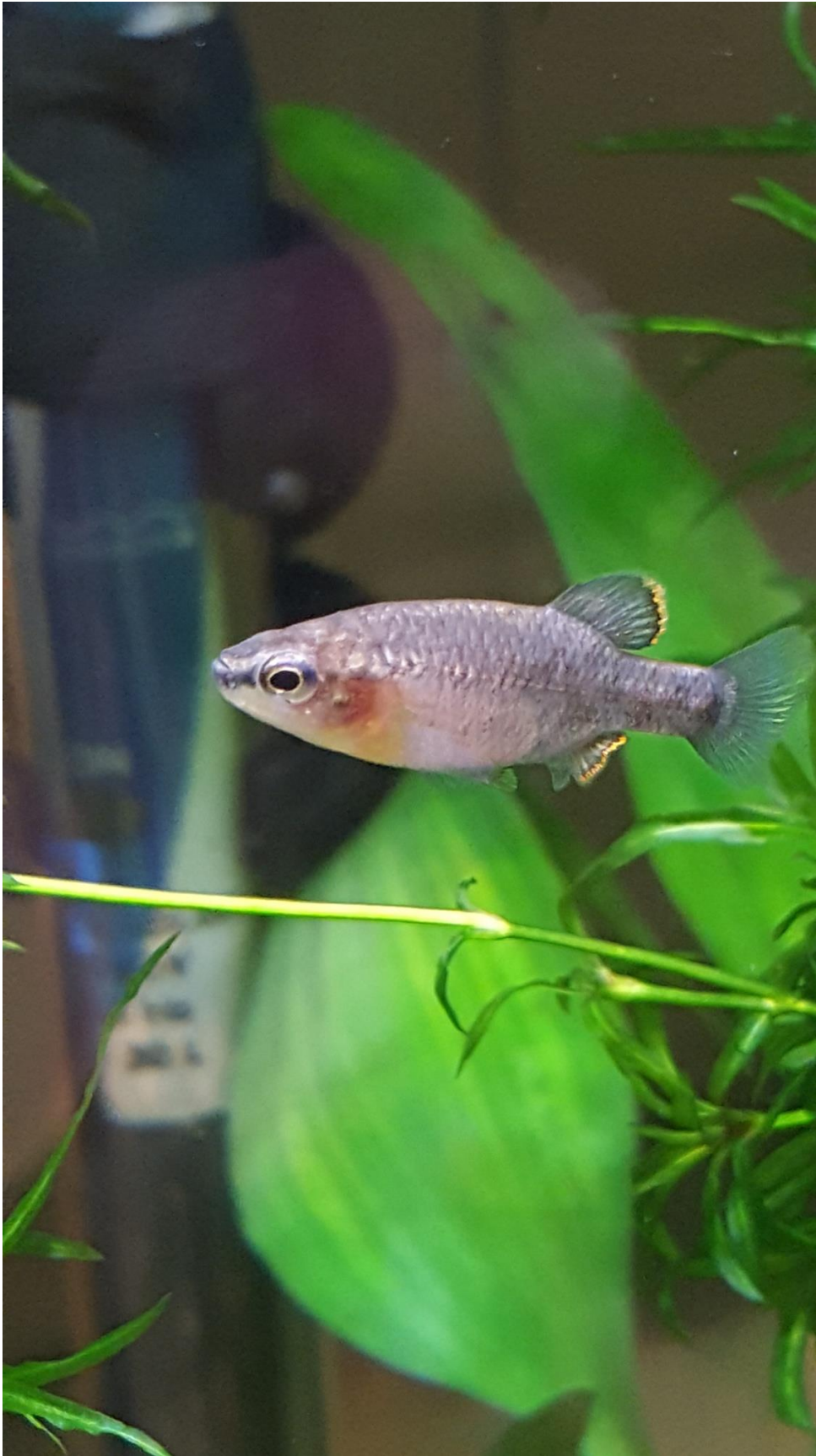
Zoogoneticus purheppechus , male