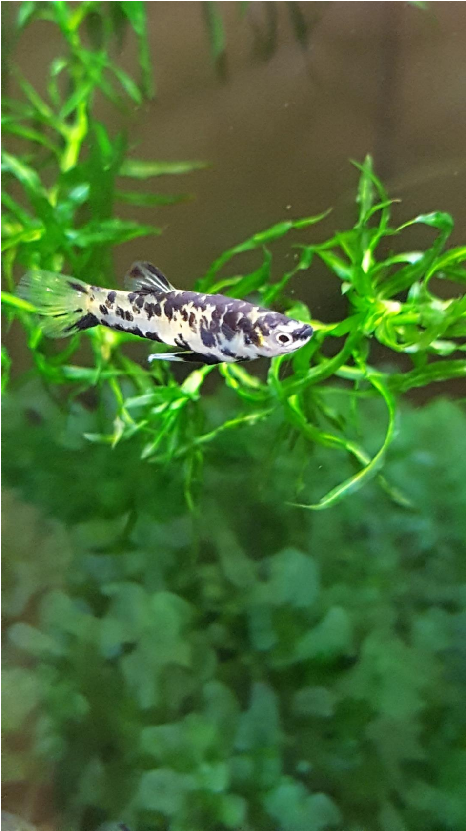
Phalloceros caudomaculatus [Male] : Photo :- J. Sara Fulton