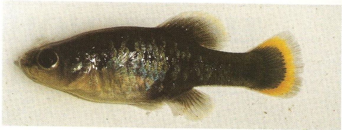
Male Crescent Zoe, showing the characteristic fin markings responsible for its common name.