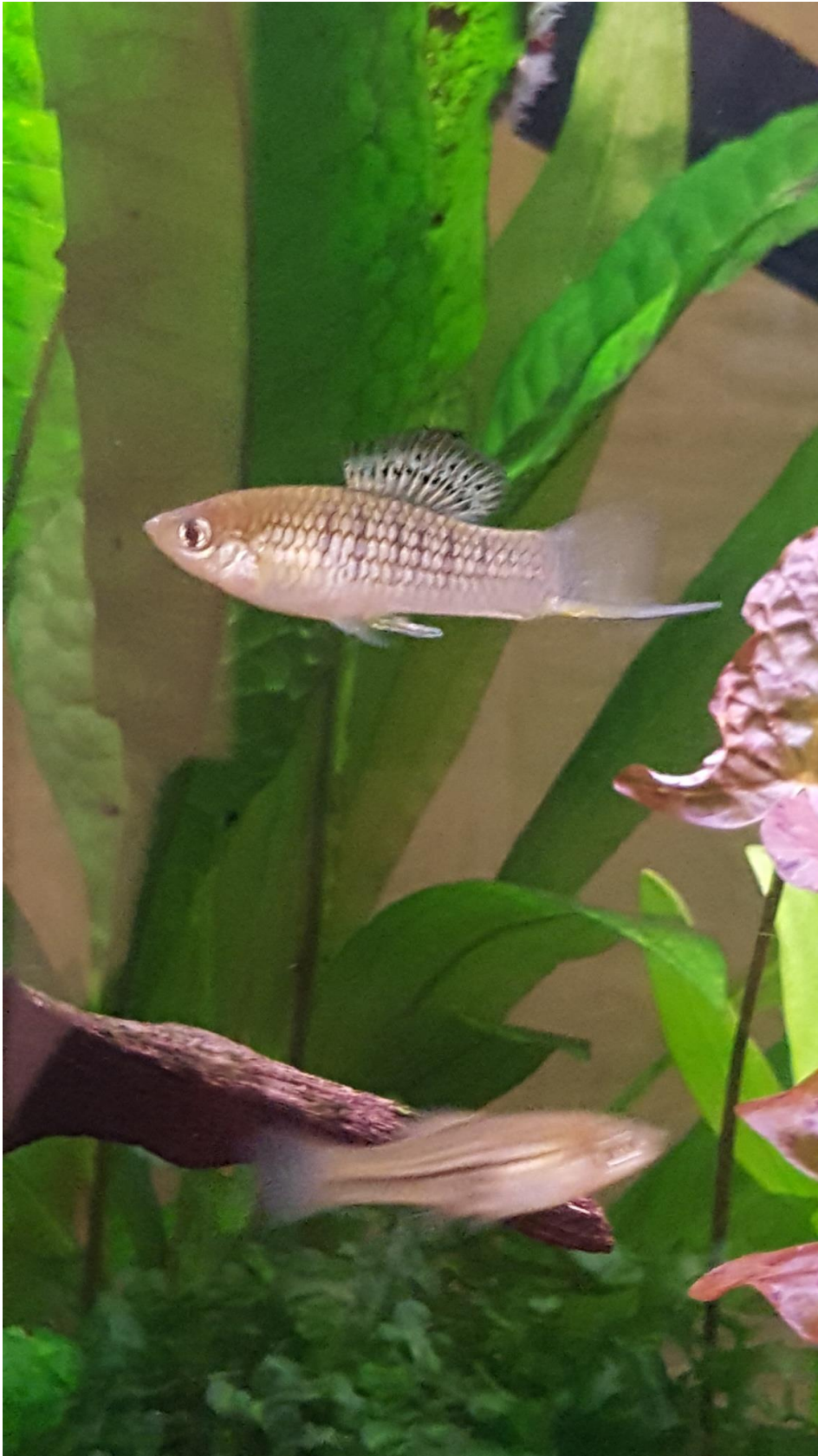
Xiphophorus nezahualcoyotl