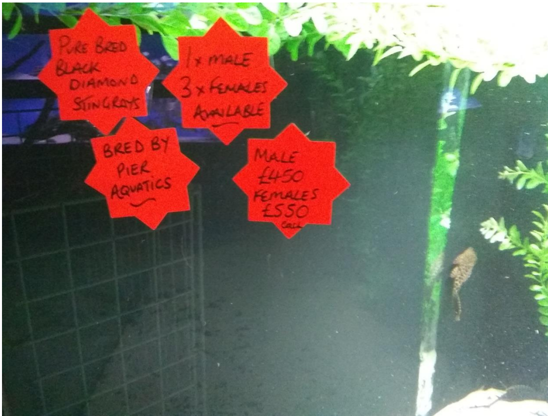
Tank label, Pier Aquatics, Wigan

Ah! Now I know why BLA members never mention Fresh water stingrays. I don't have £1900 spare for a group of four fish, [even if I did have a tank big enough for them or the facilities to grow them on to adult size and get them breeding] and I doubt that many other people do either