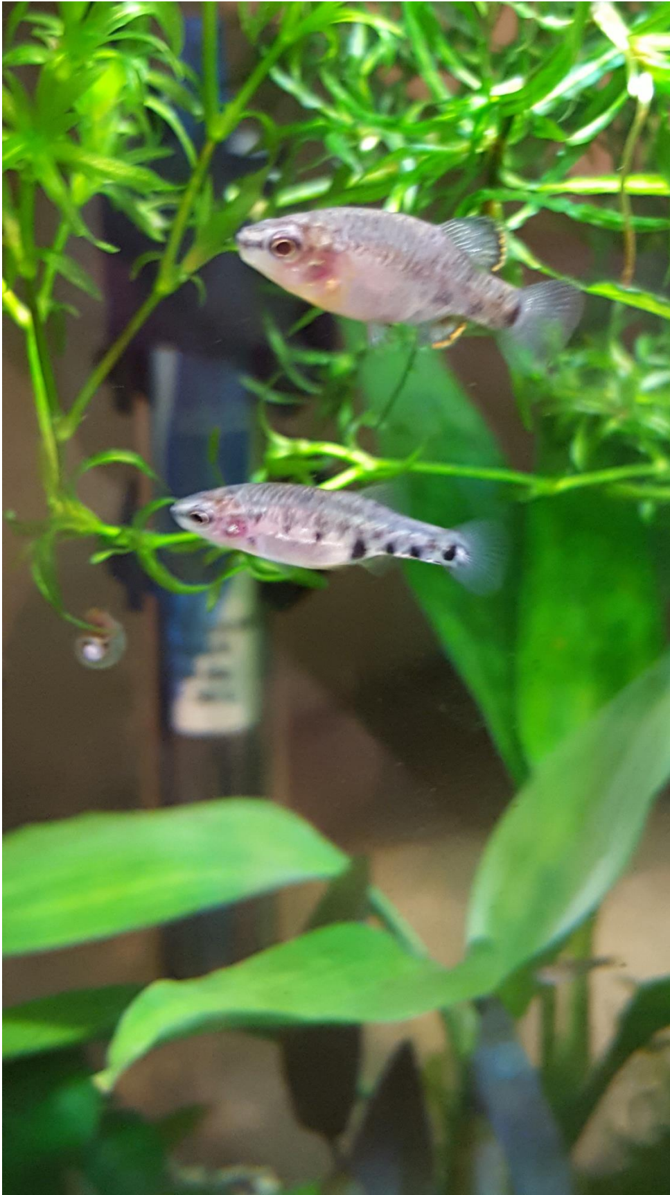
Zoogoneticus purheppechus , pair 25