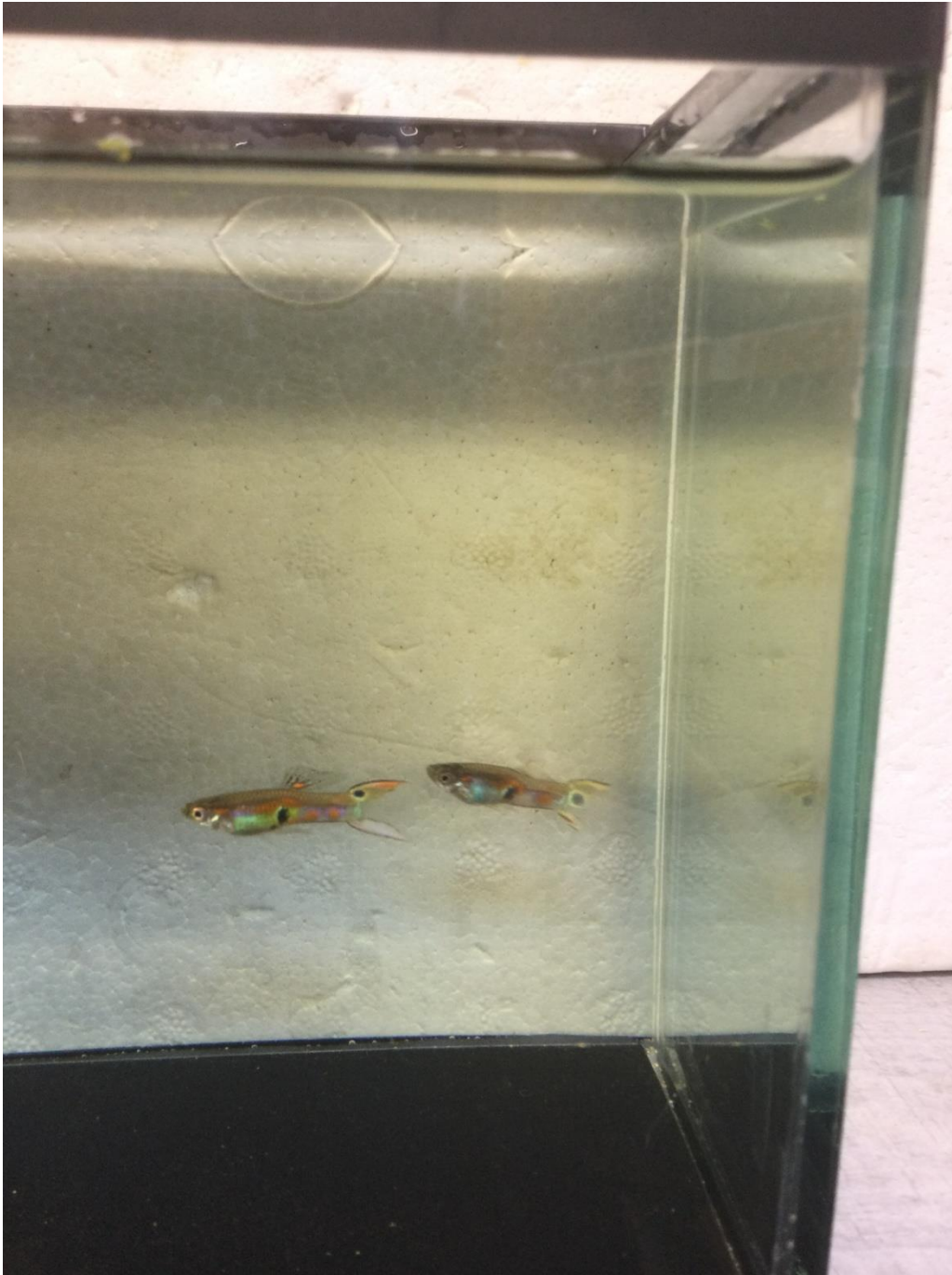
"Note the dark blue spot above the gonopodium in all the males :- Photo :- Clive Walker