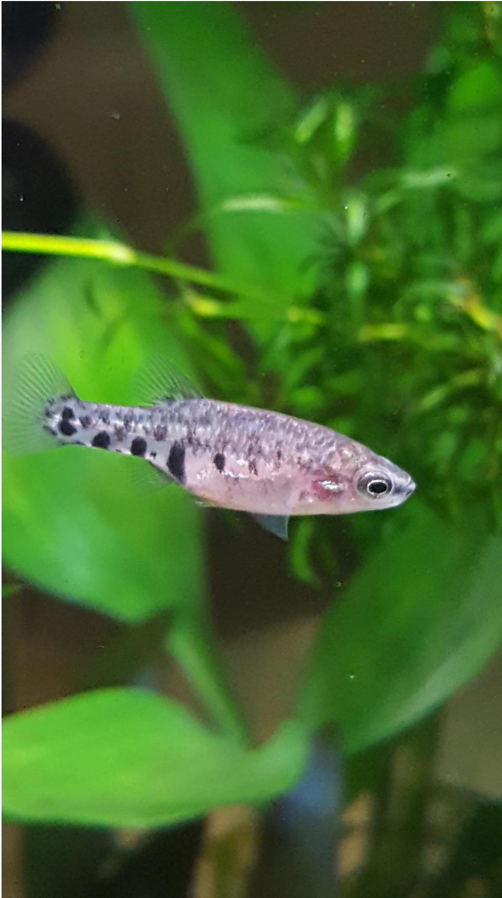
Zoogoneticus purhepachus , female 27