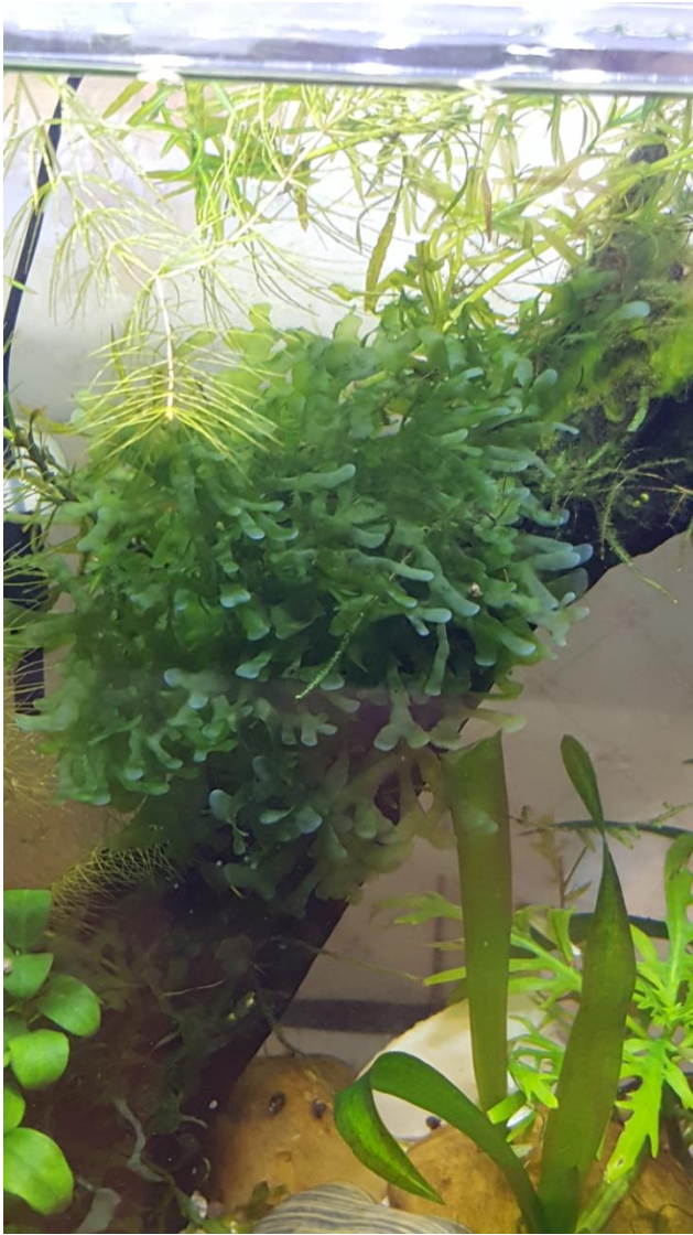
Details of Sara's planted tanks. Photos