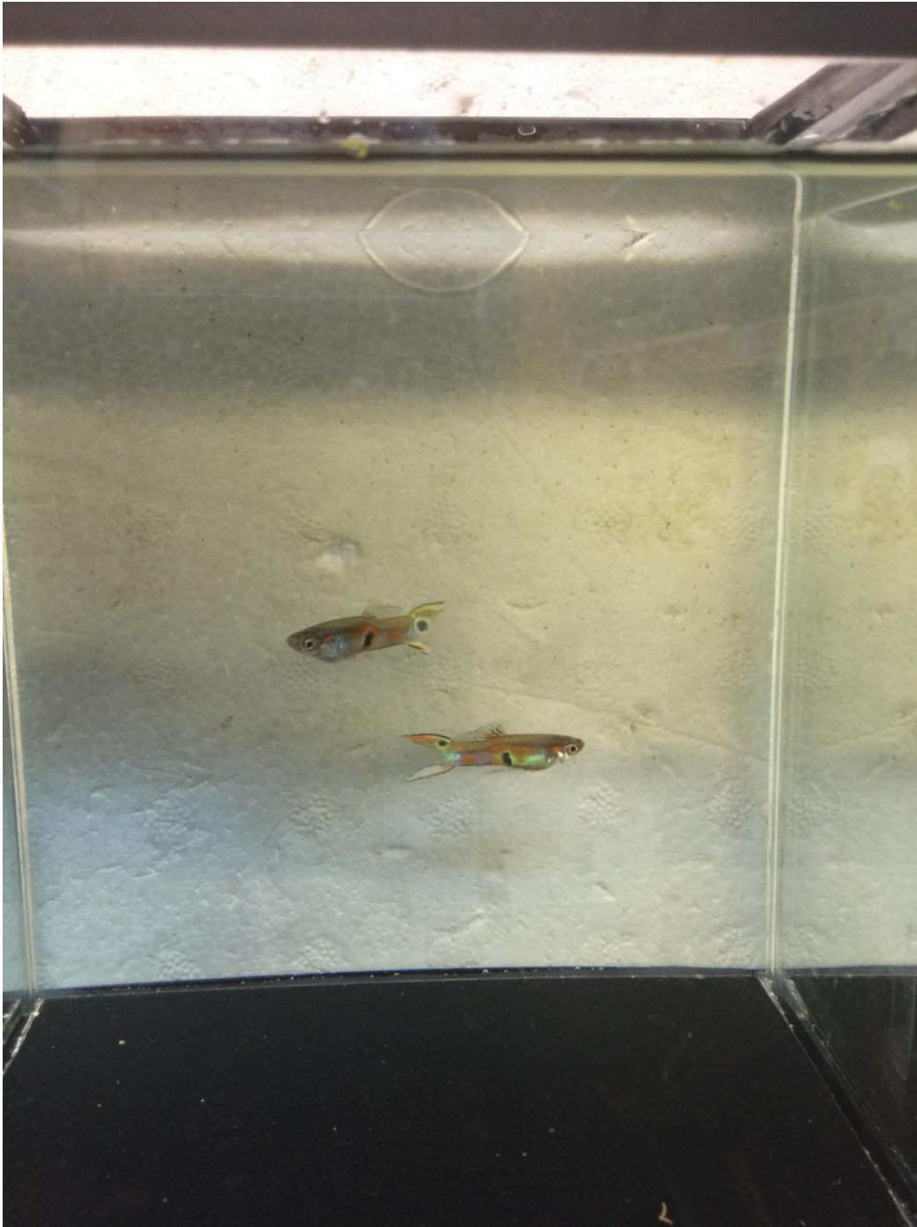
The new mutant Bristol Guppies