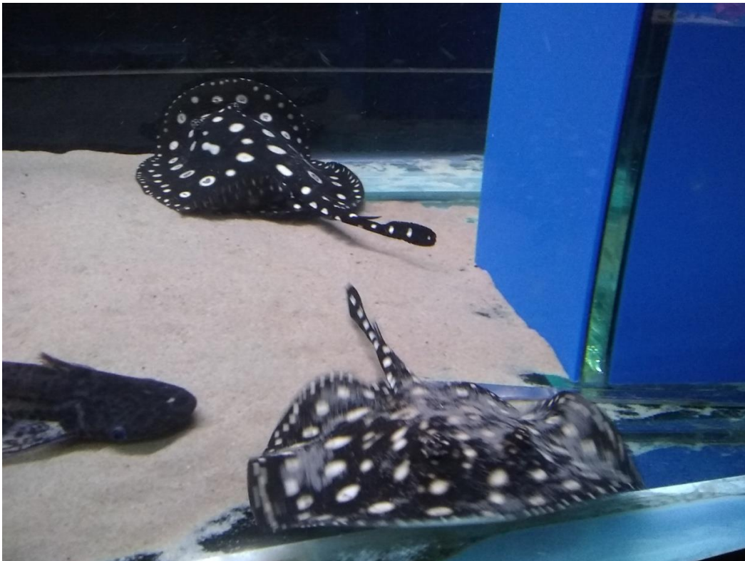
Fresh water stingray, pair, at Pier Aquatics, Wigan