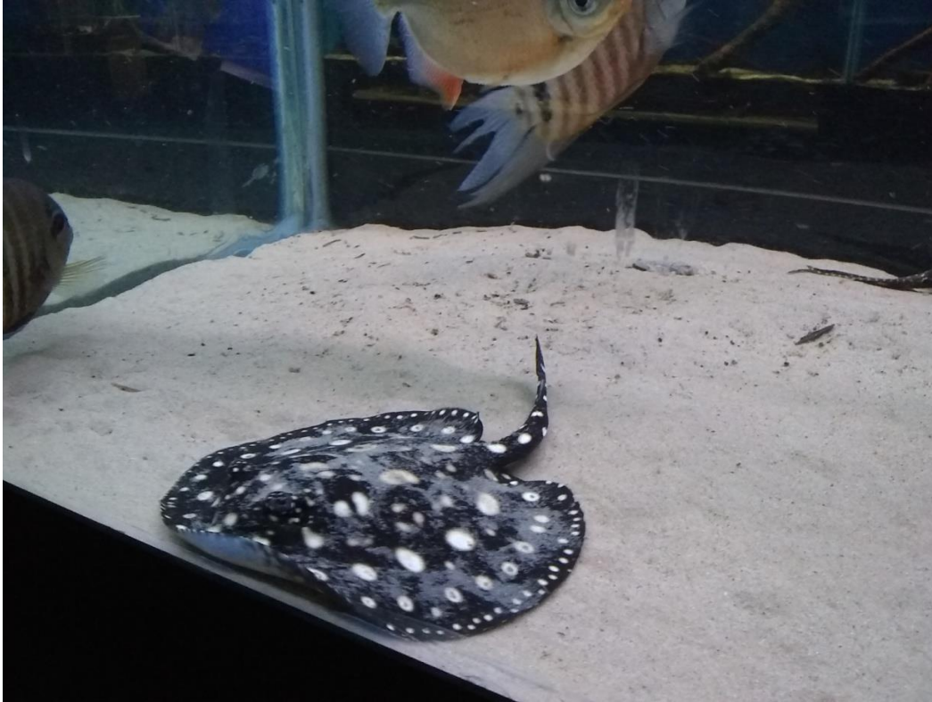
Fresh water stingray at Pier Aquatics, Wigan

Fresh water stingrays are livebearing fish, so why do we never see them at BLA events? Why don't I know of any BLA member who keeps them?