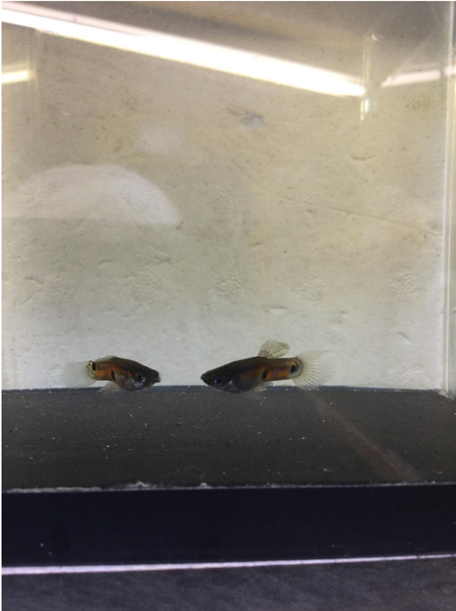
Original Bristol Guppies : Photo :- Clive Walker