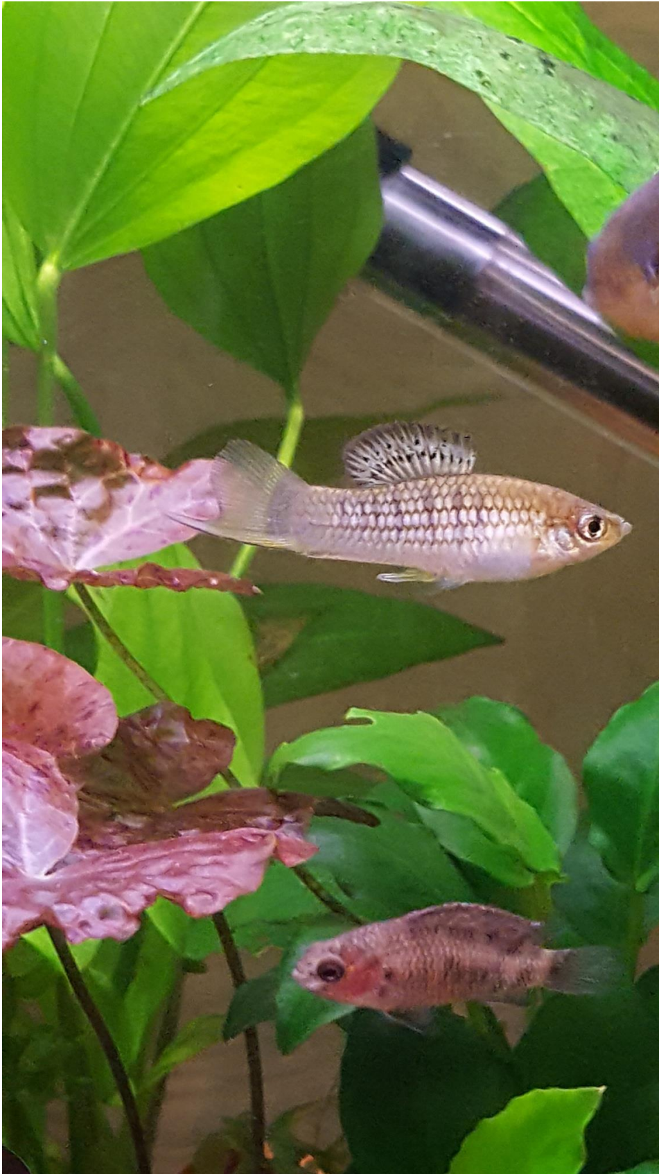
Xiphophorus nezahualcoyotl with Laetacara dorsigera